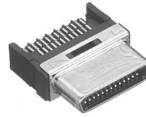
Cable side female connector Solder terminal type P/N: HDR-E26FSG1+ Applicable back-shell: P/N: HDR-E26(LPM+, LPH, ALPA+)