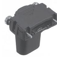
R/A Back-shell with metal shell Screw lock type P/N: HDR-E26ALPA+ (for 6.7 x 7.5 mm oval shape cable opening) Applicable connector: P/N: HDR-E26MSG1+ (Solder terminal) P/N: HDR-E26FSG+ (Solder terminal)