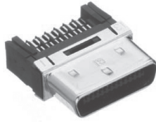
Cable side male connector Solder terminal type P/N: HDR-E26MSG1+ Applicable back-shell: P/N: HDR-E26(LPM+, LPH, ALPA+)