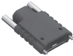
Back-shell with metal shell Screw lock type P/N: HDR-E26LPM+ (for 6.8 x 9 mm oval shape cable opening) Applicable connector: P/N: HDR-E26MSG1+ (Solder terminal) P/N: HDR-E26FSG+ (Solder terminal)